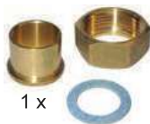
Adapters Art. 654 for capillary welding

Flow rate ranges for DN20 42 = 5-42 l/min 70 = 20-70 l/min